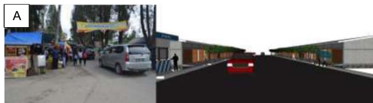
Figure 5. Police Station before and After

The other elements service furniture, which have not been located in the research area are bus stops and also Police station. Police station and bus stop are needed at the destination of Pasar Buah and Bukit Gundaling. The police station can serve to arrange traffic, along road in Pasar Buah and also Bukit Gundaling.