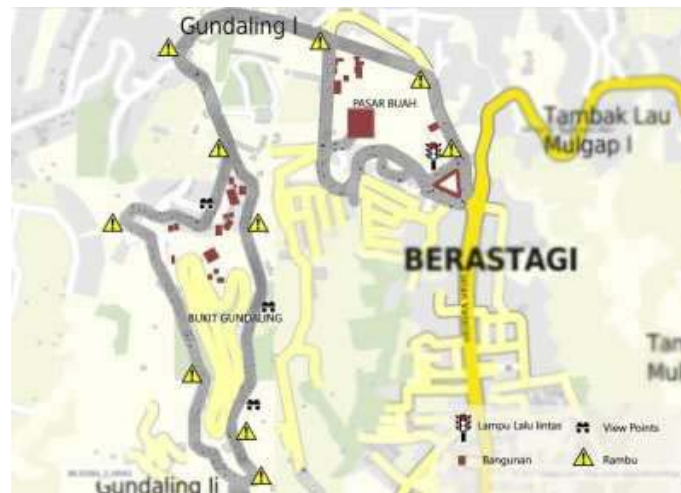
Figure 8. Site Plan Signaling Elements

Some signs do not work well in providing information to the public, due to its position being covered by other signs, advertisements or vegetation in the region. Marks, signs, and signage should be placed in the path of the amenities, at the point of social interaction, on a path with a stable pedestrian flow, with the appropriate quantity, and the materials used are made of materials of high durability, and do not cause glare effects. Designing Elements of good signs directing traffic and pedestrians to their destination [9].