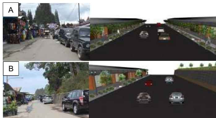
Figure 3. Street view Before and After; (a) Pasar Buah (b) Bukit Gundaling

Ornamental plants and trees for roads should be by the local climate and also weather resistant. With the planning Elements of Decorative street furniture in the location of tourist attractions, will increase the comfort of the visual aspect [6], [15].