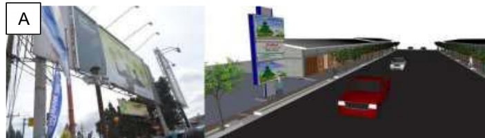
Figure 10. Reklame board before and after