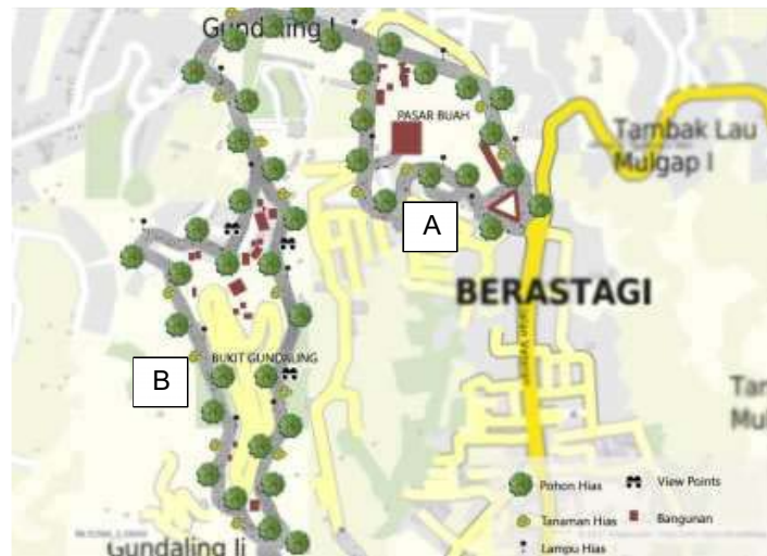
Figure 2. Site Plan Decorative Elements; (a) Pasar Buah (b) Bukit Gundaling

Ornamental plants and trees for roads should be by the local climate and also weather resistant. With the planning Elements of Decorative street furniture in the location of tourist attractions, will increase the comfort of the visual aspect [6], [15].