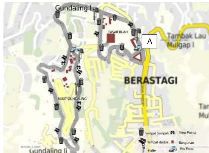
Figure 4. Site Plan Service furniture elements

The other elements service furniture, which have not been located in the research area are bus stops and also Police station. Police station and bus stop are needed at the destination of Pasar Buah and Bukit Gundaling. The police station can serve to arrange traffic, along road in Pasar Buah and also Bukit Gundaling.