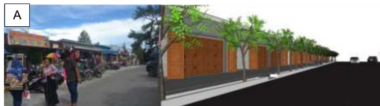
Figure 7. Stalls before and after

The regular small business activity, which is the activity of buying and selling can be done in the pedestrian space, can be the main attraction of the tourism object [4], as in the Pasar Buah in the picture, but can cause problems if the pedestrian space is not organized good. Terms of utilization, Distance building to the trading area is 1.5 to 2.5 meters, so as not to disturb pedestrian circulation. The pedestrian width is at least 5 meters, and the width of the selling area is a maximum of 3 meters, or 1: 1.5 between the width of the pedestrian path and the width of the trading area [4].