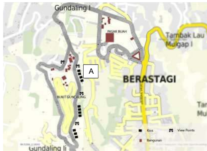
Figure 6. Site Plan Trade Furniture