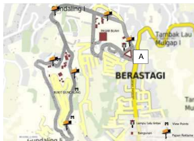
Figure 9. Site Plan Advertisement elements

Elements Advertising on Pasar Buah and Bukit Gundaling has a location that is not strategic and make the atmosphere of the location of the resort becomes less beautiful, especially the location of Pasar Buah Object, there is a large billboard. Size The billboards are too big to cause the billboard to be visually prominent on the location of the attraction. While at the Bukit Gundaling there are advertisements placed on the sidewalks, which can disrupt pedestrians when using sidewalks. Can be placed at the point of social interaction to meet the economic needs of the region [4]. The advertising element placed around the road segment must be medium-sized and do not interfere with pedestrians using sidewalks around the road. Otherwise, the size of billboards should not stand out.